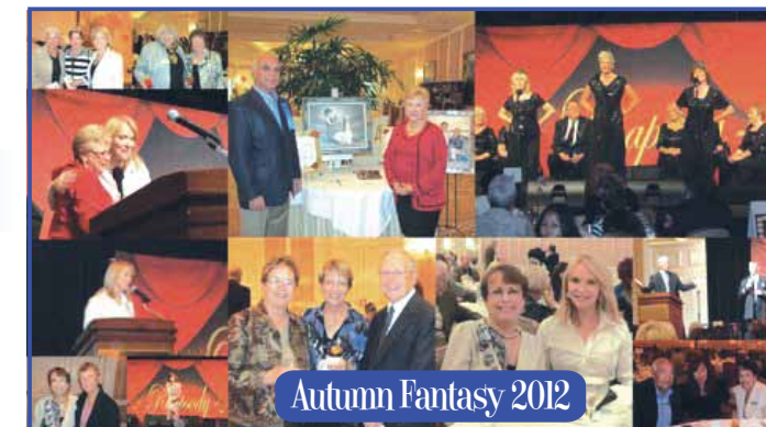
Autumn Fantasy 2012

From this pool of generous hearts came the idea of providing Christmas for these children. Needless to say, Santa was able to fulfill many requests. This last Christmas was especially meaningful to ALNC volunteers and this is what our organization is about. ★